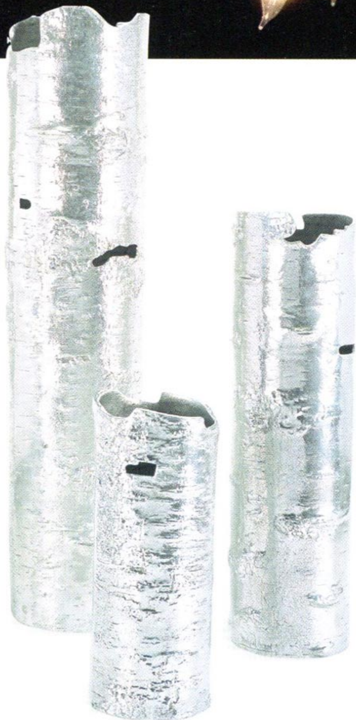
FANTASY FOREST From Michael Aram's Forest Leaf collection, the polished aluminum Bark Vases come in three sizes. michaelaram.com