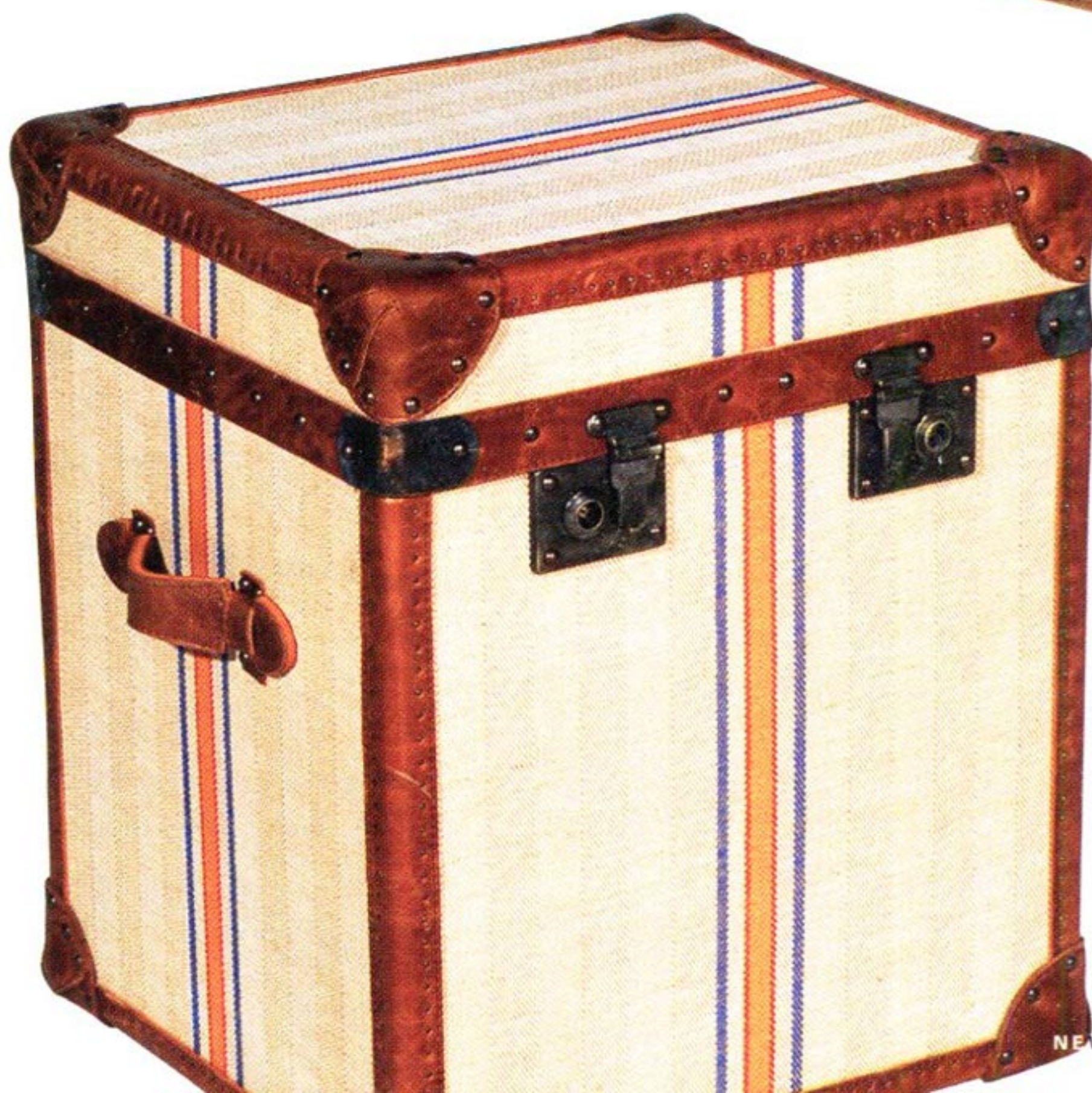
STOW AWAY Storage-starved city folks see the practical side of Timothy Oulton's London Trunk, a nod to the heady days of Grand Tours. Shown in Flour Sack fabric. 19.3"W x 22.5"H. abchome.com