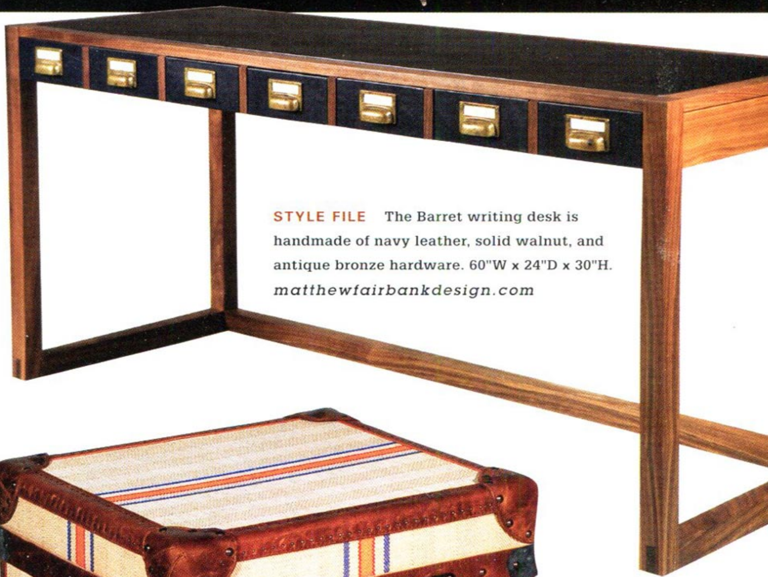
STYLE FILE The Barret writing desk is handmade of navy leather, solid walnut, and antique bronze hardware. 60"W x 24"D x 30"H. matthewfairbankdesign.com